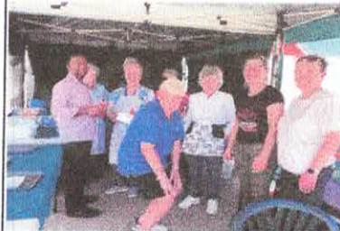
The hard-working team at the Bunnings Cathedral BBQ on 30 December